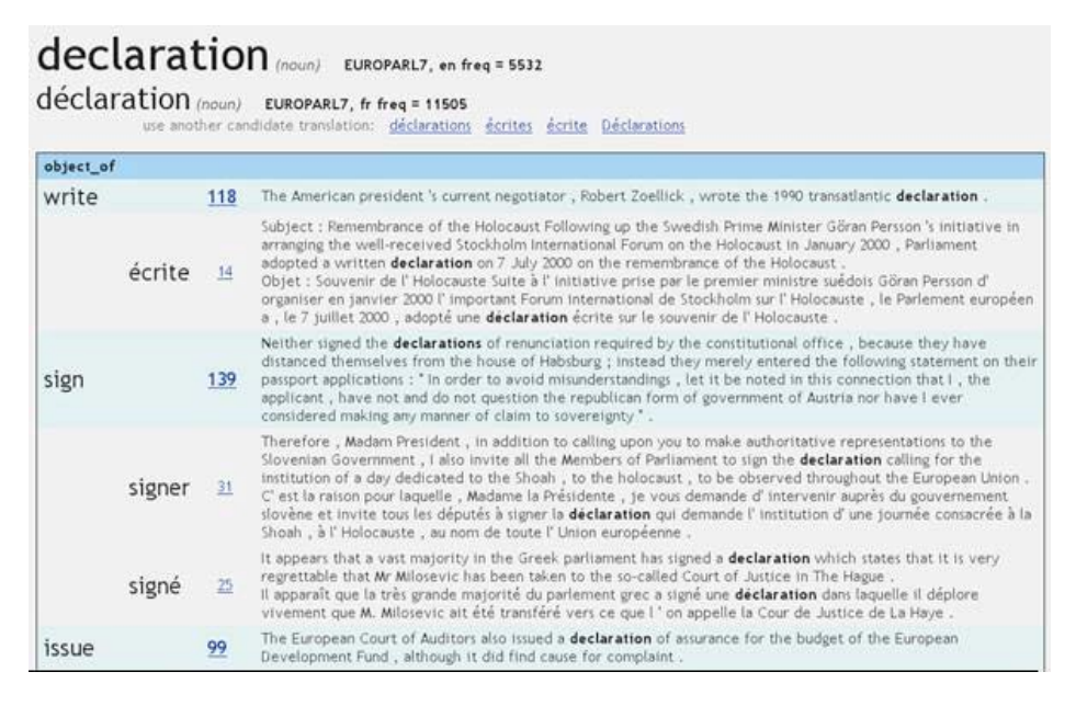
Figure 2: Bip word sketch for declaration/déclaration.

A bilingual sketch produced using this method, also showing the aligned chunks with both L1 and L2 collocations, is shown in Figure 2.