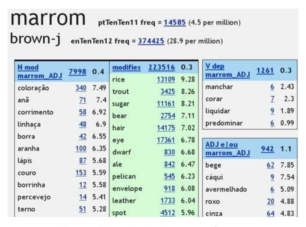
Figure 4: Bim word sketch for marrom/brown.

Bims are bilingual word sketches based on m anual selection of headwords. In this approach the user chooses the two words, usually translation equivalents from two different languages, whose word sketches they want to compare, and the corpora to be used. The two word sketches are spliced together. This takes forward something that bilingual lexicographers have been doing since word sketches were first developed: opening two browser windows side by side, with one word sketch in each. A bilingual sketch for English brown and Portuguese marrom is shown in Figure 4.