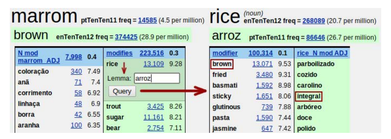
Figure 5: "Finding the missing translation" functionality.

For a user, some matching pairs are immediately evident from the bim sketch ( brown leather, couro mar-rom ) but others are not. We do not find anything equivalent to brown rice on the Portuguese side of Figure 5. The user then wants to know "how do you say brown rice in Portuguese?" To meet this need, a new function has been added: the user may click on rice to reveal a text-input box where they can input the missing target-language equivalent (here, arroz ). A new bim word sketch appears, as illustrated in the same Figure 5. This feature helps the user find the missing translation: here, arroz integ-ral for brown rice .