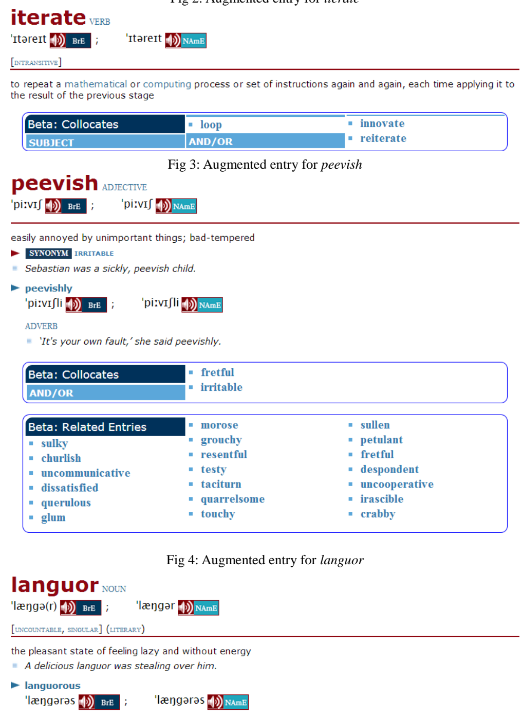
Fig 2: Augmented entry for iterate

'læŋgərəs ) BrE ; 'læŋgərəs ADJECTIVE • a languorous pace of life • languorously () BrE ; () NAME ADVERB Beta: Related Entries • lassitude • debility