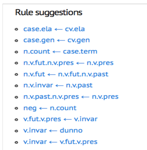
Figure 1: Screen shot of rule suggestions (9 November 2013)

This paper reports on the development of a rule-based part-of-speech tagger for Classical Tibetan.*Far from being an obscure tool of minor utility to scholars, the rule-based tagger is a key component of a larger initiative aimed at radically transforming the practice of Tibetan linguistics through the application of corpus and computational methods.